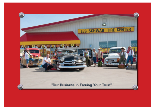
May 2012 Les Schwab Tire Center

Our sponsors for each calendar page paid for all our costs to produce 1,000 calendars which we then sold. We were able to donate $2,500 to Chicks n' Chaps!!!! A Great Big Thank You to All Our Sponsors!