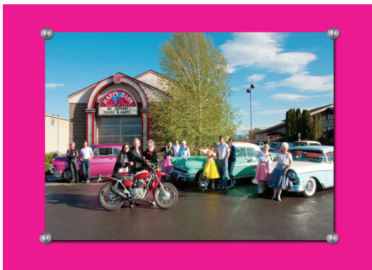
July 2012 Happy Days Car Wash