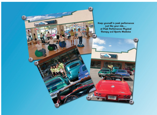
Feb. 2012 Peak Performance Physical Therapy