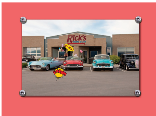
Sept. 2012 Rick's Auto Body