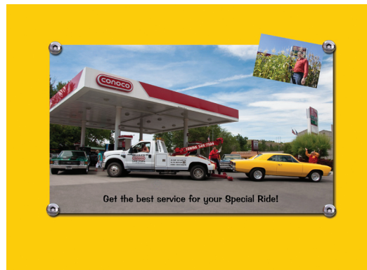
Aug. 2012 Hellgate Conoco