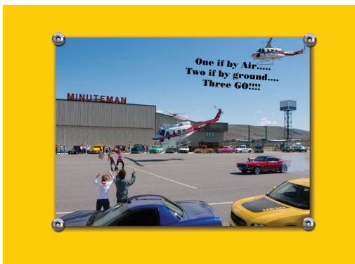
April 2012 Minutieman Aviation