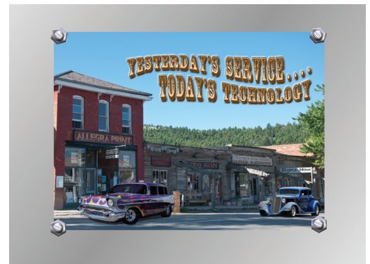
March 2012 Allegra Printing & Signs Now