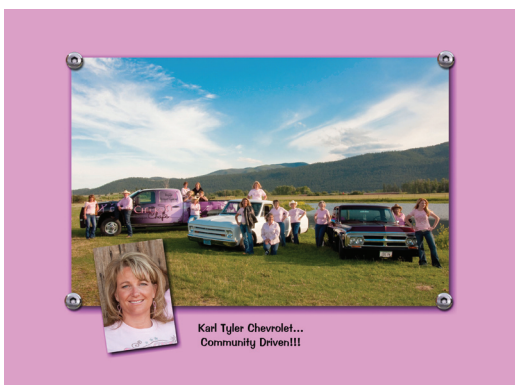
Oct. 2012 Karl Tyler Chevrolet